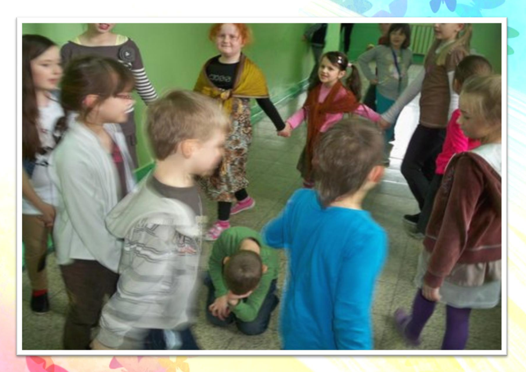
We are responsible for each other