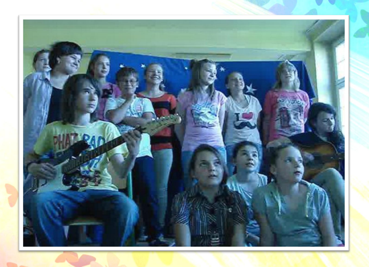
A song: Count on me